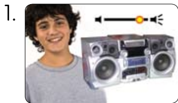
turn up the volume