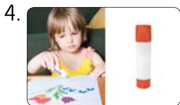
use up the whole glue stick