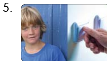
turn off the lights