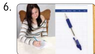
fill out the form