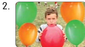
blow up the balloons