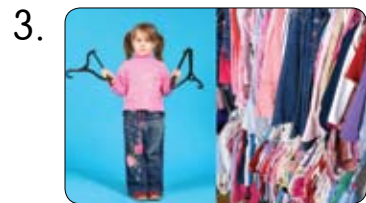
hang up the clothes